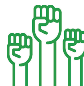
HUMAN RIGHTS DEFENDERS