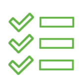
STOCK TAKING OF SDG PROGRESS