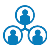
MULTI STAKEHOLDER ENGAGEMENT